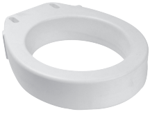
Elongated Raised Toilet Seat